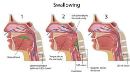
Fig 1: Normal swallowing process

The University of Limerick is interested in seeking partners to exploit the commercial potential of the OroPress technologies by entering into licensing agreements, using the technologies as the basis of a Spin-Out company and/or innovation partnerships that mutually benefit both parties.